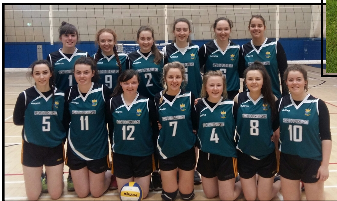
Volleyball Well done to our Senior Volleyball team who were narrowly defeated (25, 24) (25, 23) by ArdScoil Na Mara Tramore in the National Semi-finals held in UL sports campus recently.