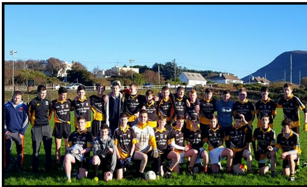
GAA Congratulations to our Junior Boys GAA team who recorded another comprehensive victory against Colaiste Pobail Acla and finished top of the Junior D League this year.