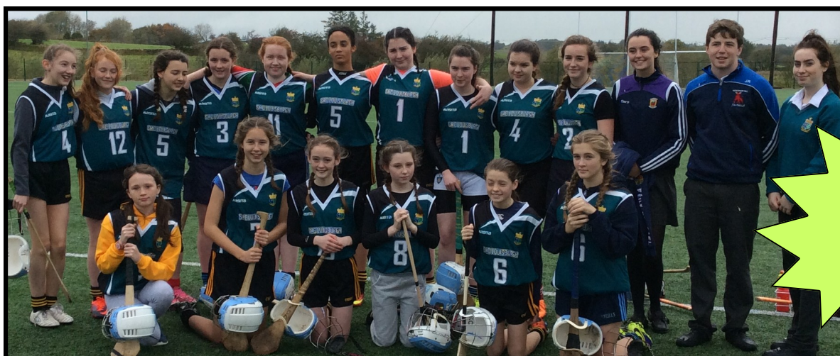
Junior Camogie Team