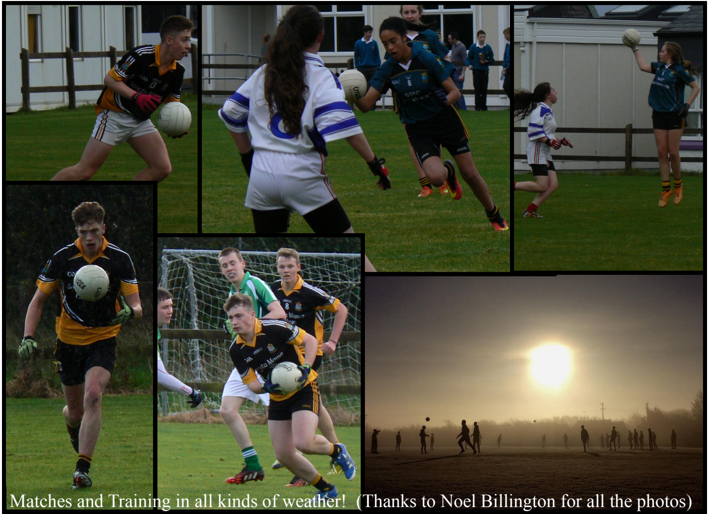
Matches and Training in all kinds of weather!